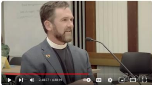
SRVUSD Board of Education Meeting 11-14-2023

San Ramon Valley Unified School District (SRVUSD) is committed to creating a safe and welcoming learning environment for every student.