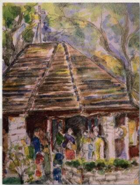
St. Timothy's Episcopal Church Danville, CA https://sainttimothysdanville.org 2018