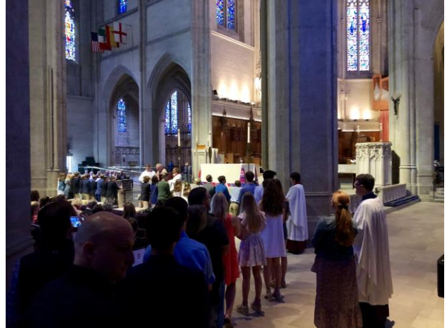
St. Timothy's lining up