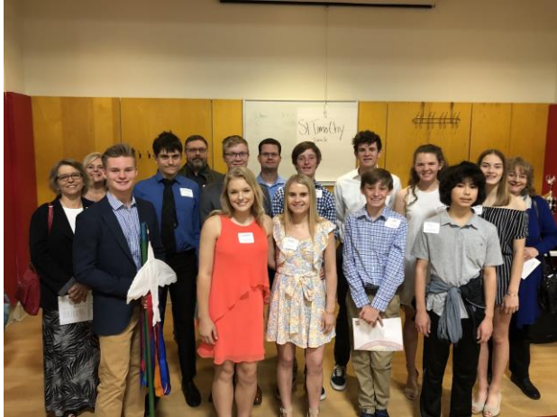
Getting ready in the Cathedral gym