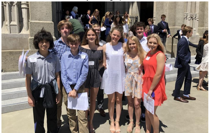
After the service