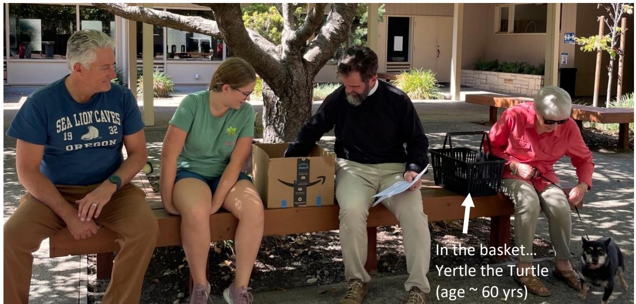
In the basket.. Yertle the Turtle (age ~ 60 yrs)