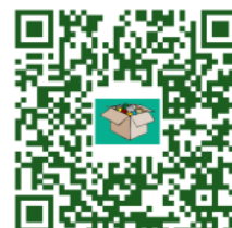
Fill a Box FOR Me Christmas Food Box for MCC