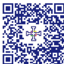
Giving (St. Timothy's via Breeze)