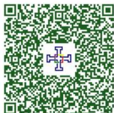
2025 Pledge Form