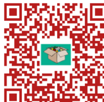
Fill MY Own Box Christmas Food Box for MCC