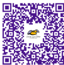
Volunteer at Loaves & Fishes