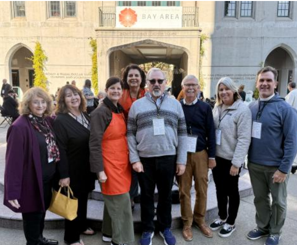
Bunco - Pumpkin Decorating Clergy Retreat - DioCal Convention