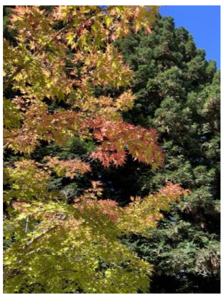
View From the Columbarium

When I was in seminary I loved "The Love of Learning and The Desire for God." The book deeply impressed on me that God is not something that is just a feeling, but rooted in the traditions, questions and rigors of the intellect and heart together. Answers are complicated and not finite and sometimes that flash of understanding is also a generous burning of Love that cannot be explained. Inside the whoosh of a cool wind I give thanks for abundant harvests and Christ who meets me in the darkness and the delight of a poem read in the golden light of the afternoon. Perhaps, fall is about God's generosity of Love and a demand for Mercy. As sunlight shifts and our lamps go on earlier in the evening, our hearts open more deeply to demand Justice because we see God's people no longer trapped in the bright lights of summer. As the shadows lengthen we savor the lavish giving of God's harvest and are moved to share the scent of cinnamon and pumpkin with others.