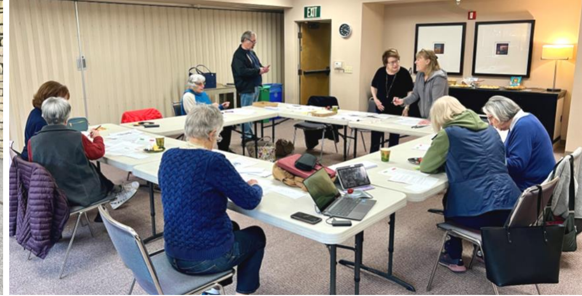
Diocese of California Executive Council at Bishop's Ranch