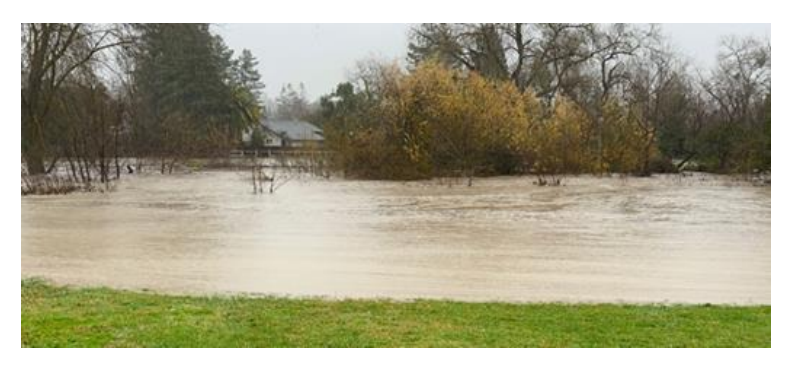
Take away from me the noise of your songs; I will not listen to the melody of your harps. But let justice roll down like waters, and righteousness like an ever-flowing stream. Amos 5:23-24

God, help me to walk in the waters of your Love. When I cannot walk, help me to float, when I cannot float, send me a raft, when the torrents surround me, carry me on your breath that I may walk another day. Give me the wisdom to walk with others that we may praise your name in all Creation in the colors of your rainbow. Amen