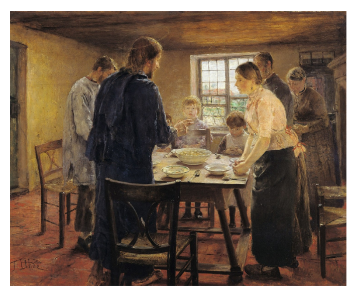
Christ with the Peasants, Fritz von Uhde, c. 1887-8, oil on panel

The promise that Jesus is present with us as we pray, as we eat, as we meet with a friend with hope, is deep within our hearts as individuals and as a community of faith—in prayers for healing, in prayers of grace, in prayers for restoration to wholeness and justice. We know that Christ stands with us in locked rooms and in the lonely hours where it seems only two or three are gathered as witnesses to the deep sorrows of living when things are difficult.